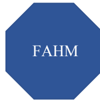
Figure 1: The Proposed Fair Automated Hiring Mark

The third-party certification for algorithmic hiring tools I contemplate would involve periodic audits of the hiring algorithms to check for disparate impact on vulnerable populations. Thus, this would not be a one-time audit but an ongoing process of periodic audits to ensure that the corporations/organizations will continue to hew to fair automated hiring practices. In return, the corporation or organization would earn the right to use a Fair Automated Hiring Mark (FAHM; see illustration of a potential mark below) for its online presence, for communication materials, and to display on hiring advertisements to attract a more diverse pool of applicants.